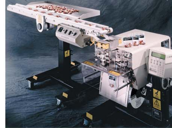
Maximizer™ Integrated conveyor infeed for semi-automatic loading.