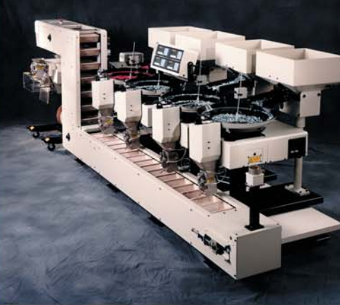
Kit-Veyor® High-productivity system for multiple component kit packaging.