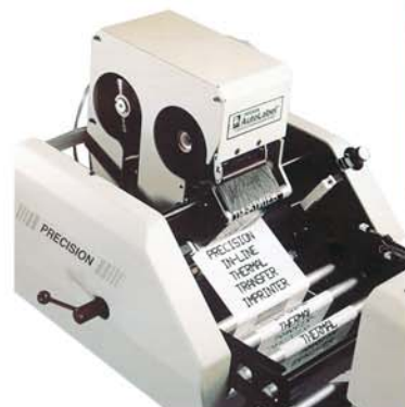
AutoLabel™ Precision Printer Inline thermal transfer imprinter.