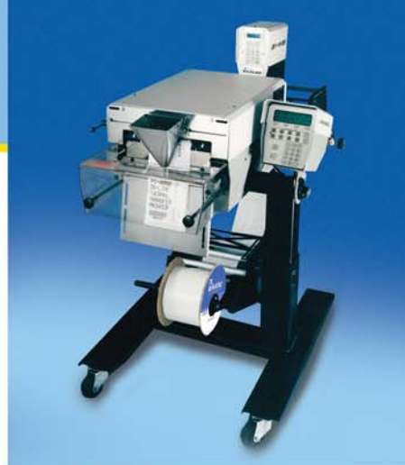
HS 100 Excel® with PI4000 Printer Complete Print-n-Pack system for high-productivity applications.

We guarantee our rebuilt equipment to operate and look like it did when it was new. Every certified rebuilt machine we offer carries a 90-day warranty on parts replacement and 30 days of free labor.