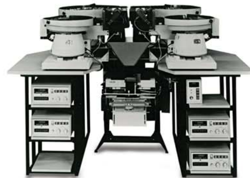
Horseshoe Bagging System Direct feeding of multiple counters for fast packaging of kits.