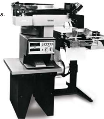
Accu-Count® and DAC-1000™ Counters Fully integrated, automatic counting systems.