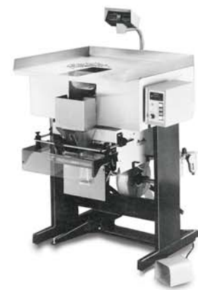
Accu-Scale® 200 Simple and accurate weigh-counting infeed system.