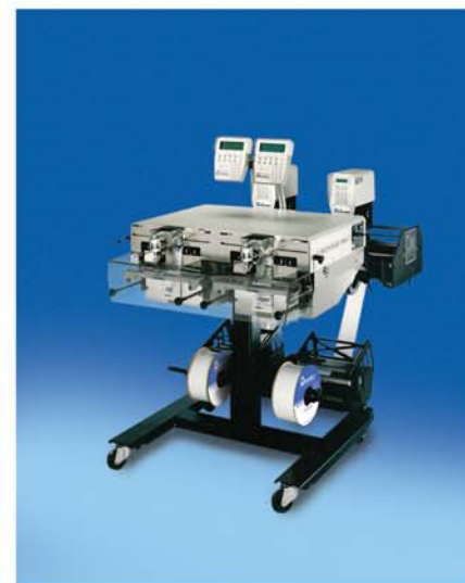
HS 211 Excel® Twin Double the productivity with a side-by-side bagger.